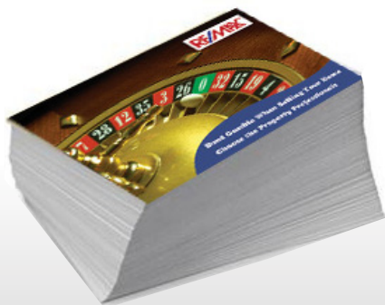
Company Business Cards